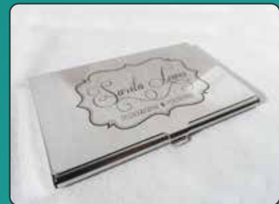
YAG laser engraving Used for engraving metal items like pens, keyrings, mugs, flasks, knives & forches

There are 2 types of laser engraving machines: