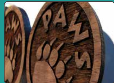
CO2 laser engraving Used for engraving organic & coated items like leather folders or wooden boxes