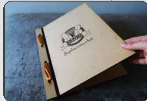
Lasercut & Printed products