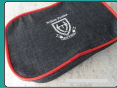
This branding process is ideal for bags and t-shirts but can also be used for umbrellas, cooler bags, and smaller items such as notebooks and folders.

Using positives and a light exposure unit, a "logo-exposed" screen is produced. Using a squeegee, ink is pushed through the screen in the areas where the logo is exposed and onto the product that is being printed. Ink is bonded (cured) with the item by sending it through a heating tunnel or oven underlying layer.